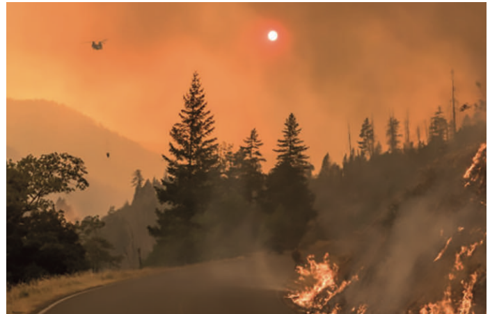
Wildfires in the Pacific Northwest – Photos: Forest Service NW

land mass as Australia. As one of their experts put it: “Everyone wants to live like the nobleman, have their own little duchy or their own little barony, even if it’s just a quarter-acre or less... but it’s not sustainable.” Instead, we need to build homes closer together to make communities safer and more defensible.