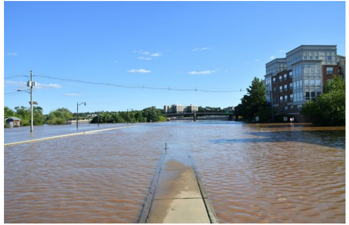
New Brunswick, New Jersey after Hurricane Ida, September 2021