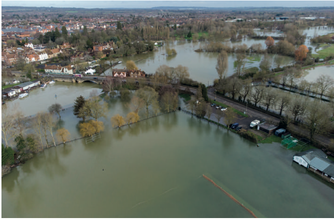
Flooding at Abingdon-on-Thames, Oxfordshire, February 2021